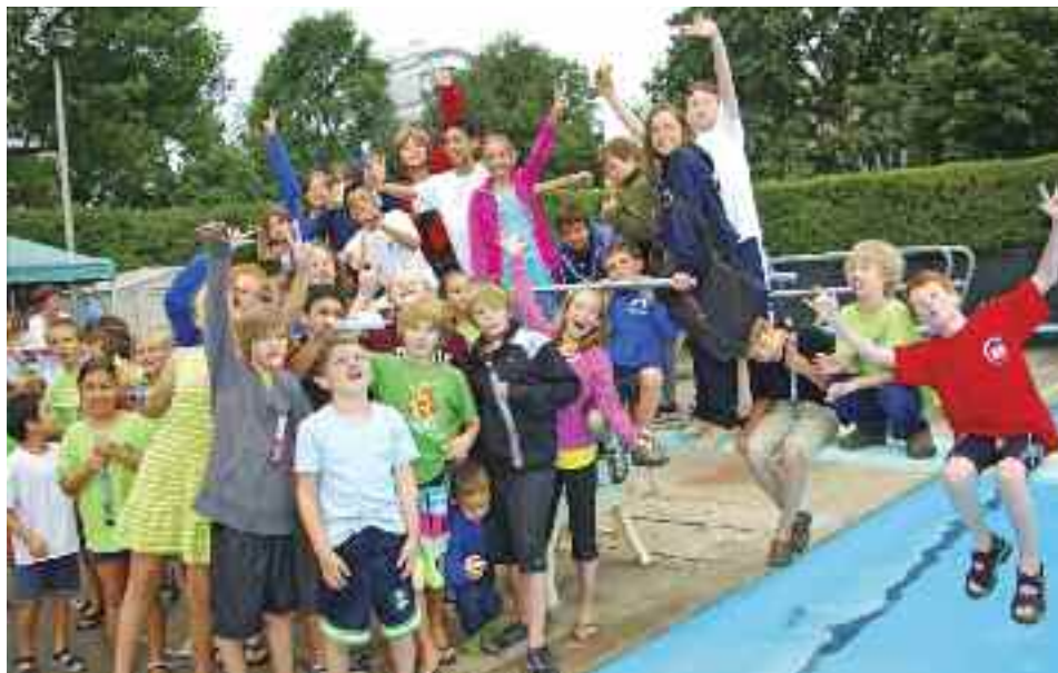
The Westmount Dolphins swim team celebrate the end of season on a diving board at the Westmount pool August 21.