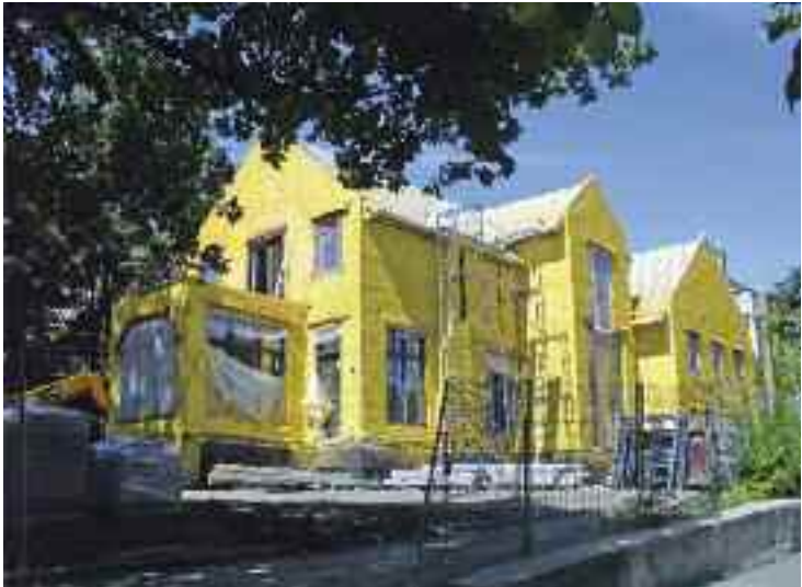
The largest permit in 2009 issued for work on a single-family dwelling was for additions to this house at 3 Murray Ave. ($1.6 million). The work is ongoing.