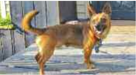
Broady