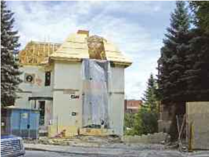
The only new construction start in 2009 was this house at 310 Côte St. Antoine for work estimated at $1 million. It replaces a bungalow.

Swiss-Master Chocolatier 4922 Sherbrooke St. W (514) 484-4747