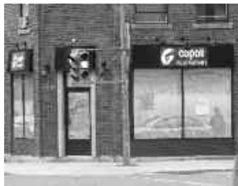
Copoli is undergoing “interior repairs”.

Copoli Restaurant (4458 St. Catherine), known for its oversized hamburgers, has closed for renovations until further notice. A building permit specifying “interior repairs” is on display at the site.