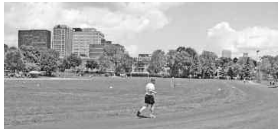
Westmount Athletic Grounds with Hollowell in the distance, looking east.

What is council's reaction? – While some councillors have expressed support, council has not as yet agreed to study its feasibility. I am confident that it will become clear that the study of the arena/pool project must include analysis of this option. I encourage residents to discuss it with their local councillor. As always, I welcome comments by email at pmartin@westmount.org .