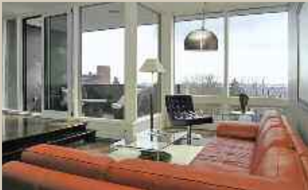
WESTMOUNT – Million Dollar Views – 627 Clarke Contemporary home with breathtaking views of the city. Completely renovated in 2008. Alternative to condo living. $2,795,000

Groupe Sutton centre-ouest inc. courtier immobilier agréé www.suttonquebec.com