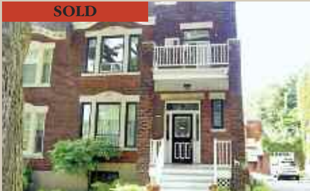
SOLD WESTMOUNT – 594 Lansdowne