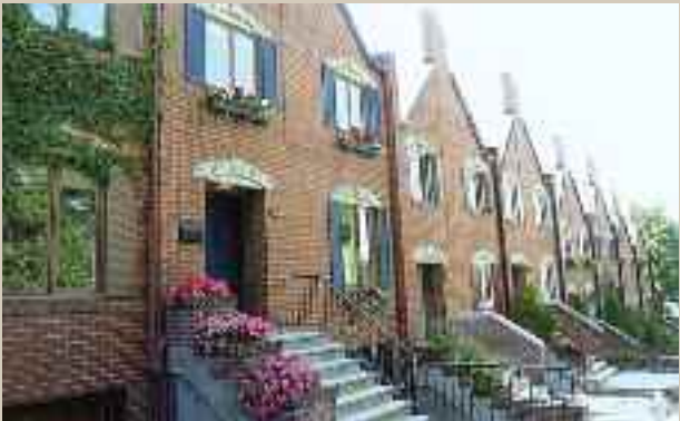
WESTMOUNT ADJ. – 2721 Hill Park Circle Beautiful townhouse in a country setting, 3 bedrooms, quiet street, walk to Beaver Lake, perfect for nature lovers. $849,000