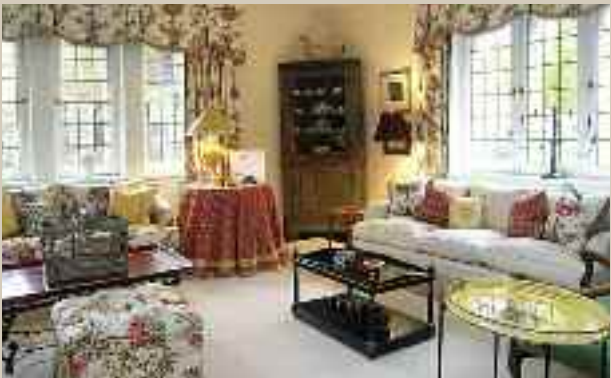
WESTMOUNT – Detached Beauty – 5 Anwoth Spectacular 3 bedroom, classic beauty and amazing interior, double garage. Don't miss this opportunity to own a gem. $2,295,000