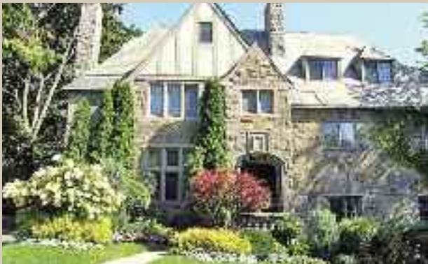
WESTMOUNT – Elegant Stone Mansion – 607 Clarke Stately 6 bedroom semi-detached family home, 3 fireplaces, double garage. Waiting for the distinguished buyer. $2,350,000