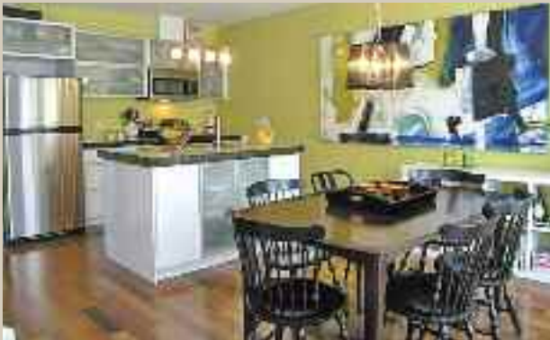
ATWATER MARKET AREA – 1901 Richardson New building 2007, one bedroom, large balcony, close to market and bike path, very sunny and bright. $279,000