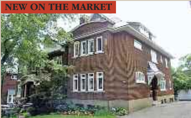
NEW ON THE MARKET WESTMOUNT – 642 Murray Hill Classic semi-detached on one of Westmount's the most desirable streets, close to Murray Park, 5 bedrooms, garden and garage. $1,595,000