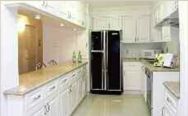
WESTMOUNT ADJ. – 2300 du Souvenir Completely renovated in 2009, 2 bedrooms, indoor garage space, walk to Alexis Nihon and Children's Hospital. $309,000