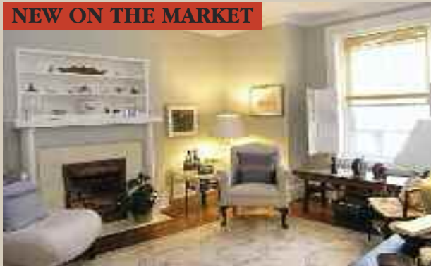
NEW ON THE MARKET WESTMOUNT – New on the Market Elegant attached cottage with garden, 3 bedrooms, quiet street, walking to Victoria Village and Westmount Park. $595,000