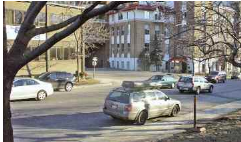
View from the arena lawn: The pole on the right designates the position of the pedestrian lights being installed on St. Catherine St. just east of the wide Bethune intersection.

Earning more is good. Keeping more is better.