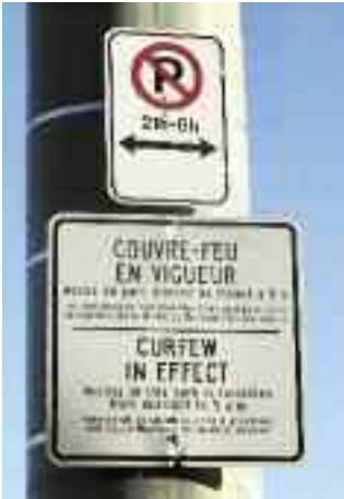
Signage at the Lookout.

The driver was issued a $37 ticket for driving a vehicle in the park, and all three received $37 tickets for being in the park after the midnight curfew.