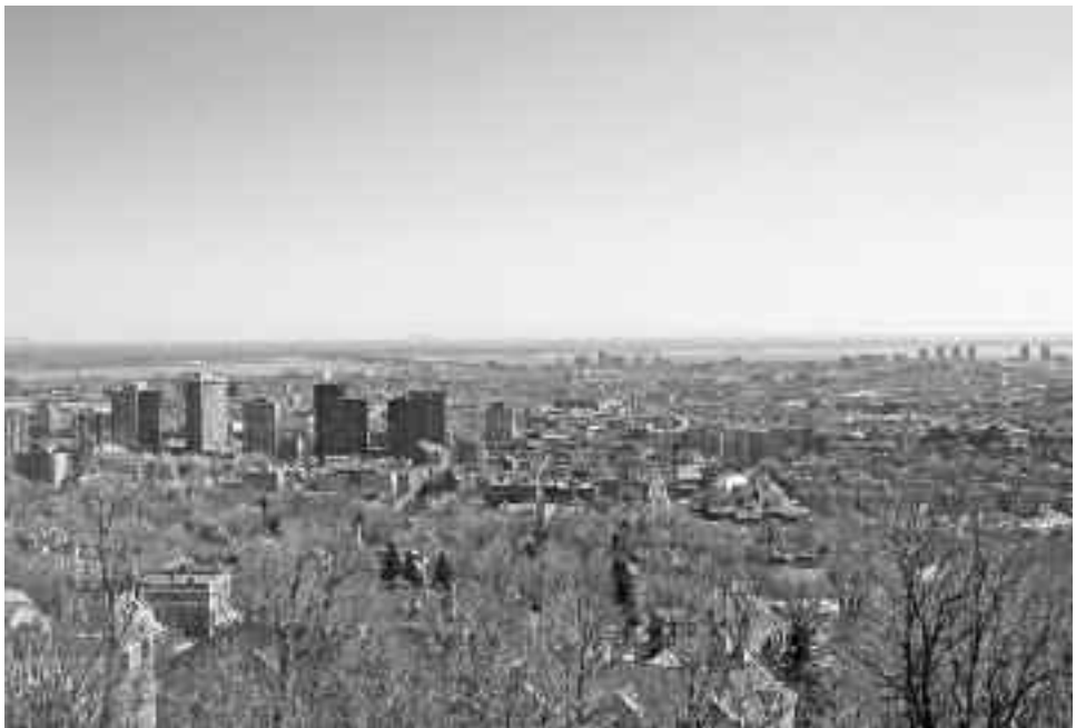
The view that launched at least two law suits.

Has it not struck the authorities that these two court cases are very similar? The