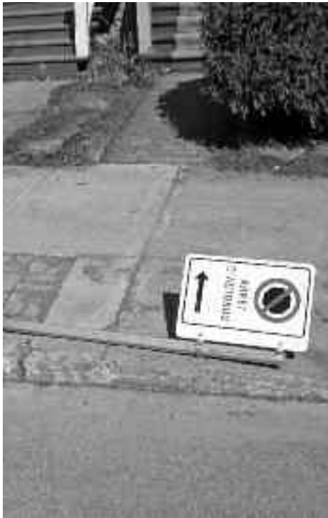
Fallen sign on Victoria Ave. after wild wind storm during the week of March 9. Or maybe it was the result of amateur parallel parking. Who knows?