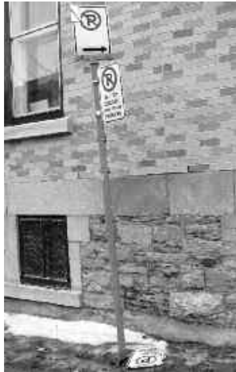
Sign limiting parking to a maximum of two hours blew off its post on Prince Albert Ave. after the same wind storm two weeks ago. Did anybody feel entitled to park in this area for more than two hours? The sign has since been fixed.