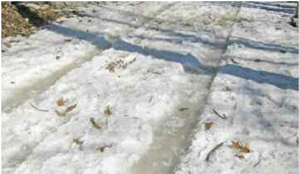
Tracks at Summit Park on March 20. The wrong-doers’ or authorities’?