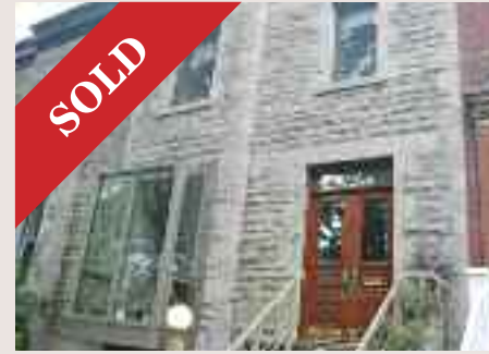
Westmount – 354 Olivier $949,000 "Townhouse on the flat"