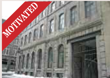
Old Montreal 325 St. Sacrement $879,000 / $6,000 a month "Penthouse loft"