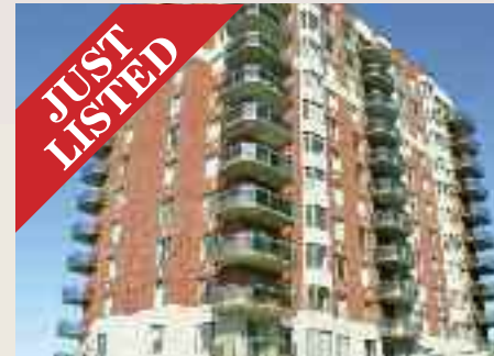
Côte St. Luc – 6803 Abraham de Sola-Le Luxor #102 – 1568 s.f. – $478,380 #1107 – 1310 s.f. – $456,094