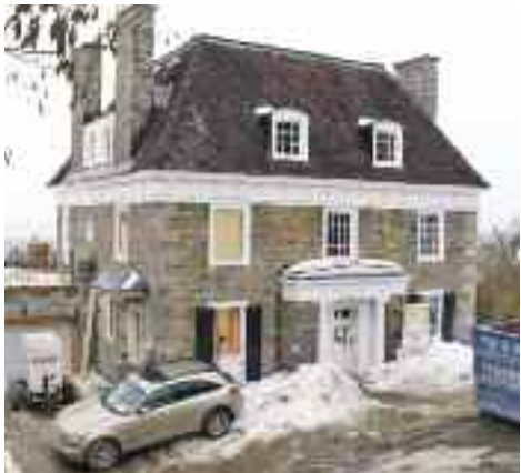
40 Belvedere Rd. just south of Sunnyside.