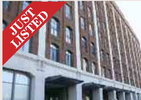
Old Montreal – 1000 de la Commune-L'Heritage du Vieux-Port #431 – 1969 s.f. – $776,015 #808 – 1623 s.f. – $913,122 #901 – 2420 s.f. – $1,270,016