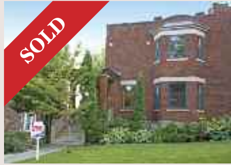
Westmount – 642 Belmont $1,795,000 "The perfect home"