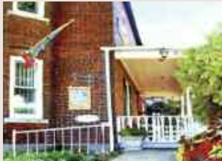
Westmount Adj. 3428 Addington $769,000 "Totally charming"