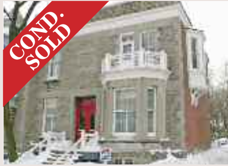
Westmount – 434 Metcalfe $900,000 "Renovators' delight"