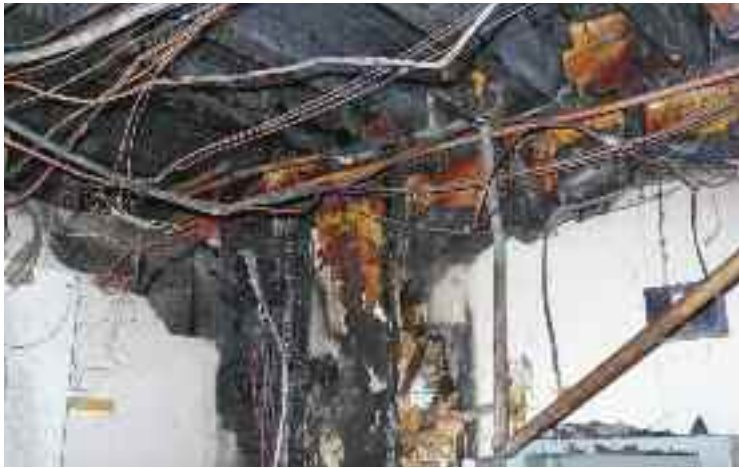
The origin: electrical distribution system.