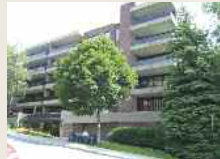
Downtown 3495 du Musée #101 $995,000 "Close to 3,000 s.f."