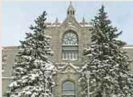
Westmount Adj. 4361 Decarie #304 $529,000 (plus GST & PST) "Simply spectacular"