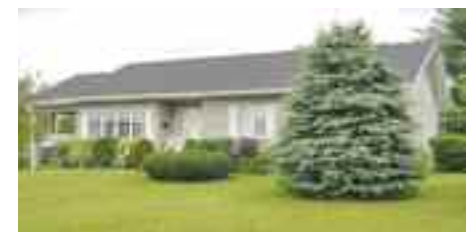
BEST BUNGALOW in another well-loved Knowlton quartier. Two steps to the daycare and community centre, the schools and the shops. Impeccable, comfortable easy-care brick home with 2 bedrooms on the main floor, two more down as well as super storage. A good starting place for $219,000.

Lois Hardacker KNOWLTON – 3 Victoria 450 242-2000 lois@royalpage.ca