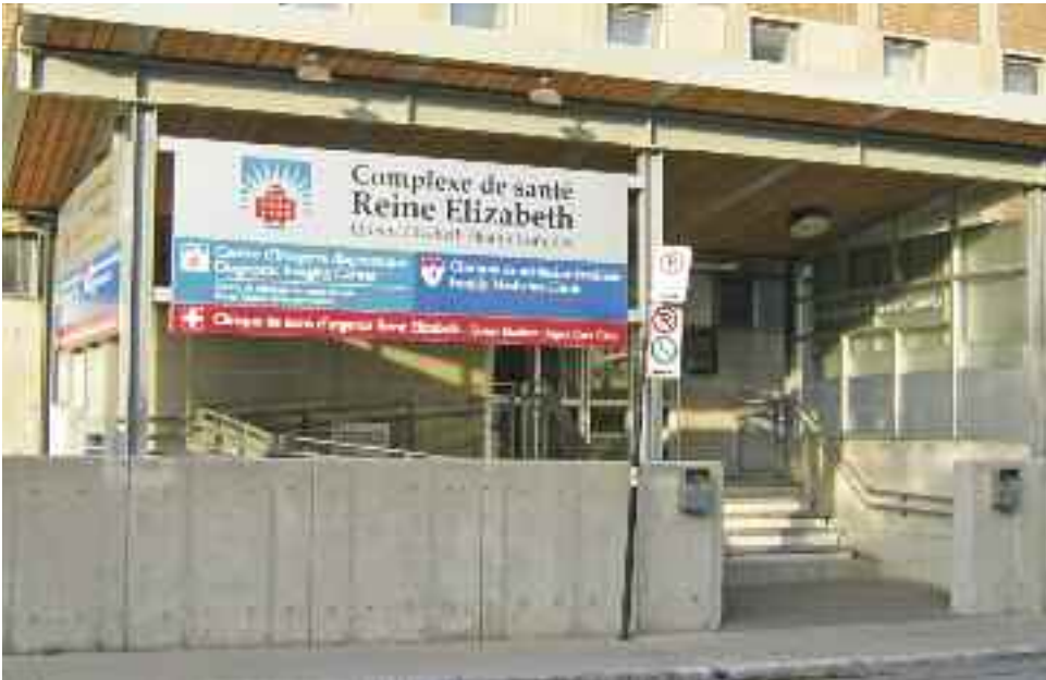
The Queen Elizabeth on Northcliffe Ave. was one of the community hospitals closed in the 1990s. It has been reborn at the Queen Elizabeth Health Complex.

Thus the government is trying to keep the level as high as possible to provide the best care to every one and has resorted to the ATM-type solution as opposed to the