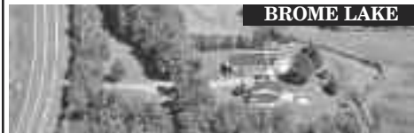
BROME LAKE 14 acres. Rustic 4 BR home with large garage, small pool, pond, woods, views and privacy. Sublime setting between Bromont and Knowlton. $359,000