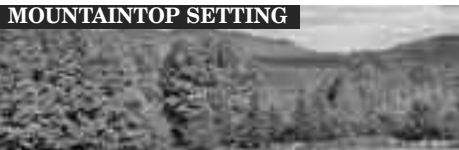
MOUNTAINTOP SETTING 31 acres. Definitely for the hard to impress! Spectacular views and location, tranquility. 1 hr to Montreal. Call me for details.