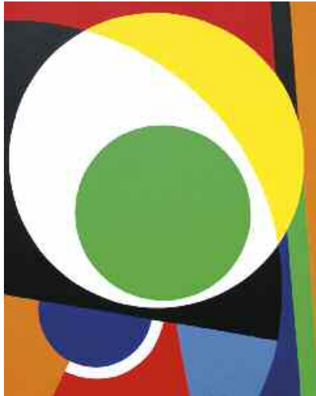
Jean-Paul Jérôme "Impressions-un"

This daring technique – the artist first paints the scene in photo-like detail before throwing or dripping paint onto the image – creates a unique special effect. Evoking mystery, this is “art as set.” In “Entrance at the Museum”, corporate figures in a cor-