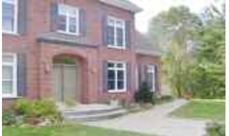
CITY COMFORTS, COUNTRY SETTING – As a weekend home, it's hard to beat with its huge southern mountain view and 2.8 acres. Also THE place to live year-round with top quality construction, 3 floors including the walk-out basement. Enormous garage/atelier, too. $635,000 Life on the Grand scale.

Eastern Townships Living by Lois Hardacker Chartered Real Estate Agent