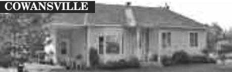
COWANSVILLE 14 acres. Impeccable, 3+ BR, country bungalow w/perennial gardens, berry bushes, barn, meadows, woods. 1 km to shops. $269,000