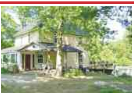
KNOWLTON NEAR THE LAKE – Wonderful neighbourhood, popular also for its proximity to town centre. Grounds with mature trees, pool and frontage on the walking path. Lots of living space on the main floor, 3 bedrooms upstairs and an attic playroom. Bring your ideas for finishing touches. $244,000