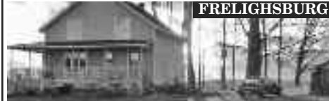
FRELIGHTSBURG 360 acres. Invest in our very precious planet. Picture postcard setting, 3 BR farmhouse. Rich meadows, diverse forest, mountain streams. $850,000