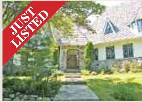
Dunham 245 Ch Paradis $1,975,000 "180 acres"