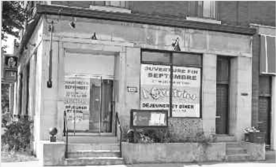
A new restaurant is coming to Westmount. L’Oeufrier, which specializes in breakfast and lunch, will open a location at the former Grosvenor Ave. and Sherbrooke St. site of Convivial and La Transition. It already has four restaurants around greater Montreal.

cause it is being tied up managing preventable chronic disorders. You must know what medications you are taking and bring them with you when you visit your doctor. You must be clear about what ails you, present it in an orderly fashion and not be concerned about every freckle. Use your precious time with your GP efficiently.