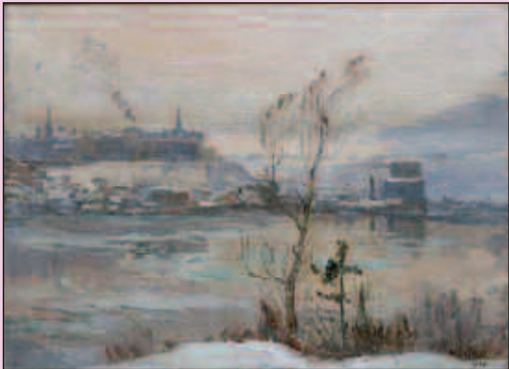
Maurice Cullen (1866 - 1934) View of Quebec from Levis, 1904 Oil on canvas, 24" x 32"

1200 Sherbrooke Street West, Montreal, Quebec, H3A 1H6 www.klinkhoff.com Tel.: (514) 288-7306 Email: info@klinkhoff.com