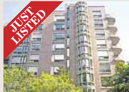
Ville Marie 3577 Atwater #809 $925,000 "3 bedrooms, 1945 sq. ft."