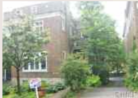
Westmount 468 Argyle $799,000 "2 level duplex"

I have families looking to relocate to Westmount because their children will be attending schools in the area. They are looking for 4 bedroom homes on the flat and 4-6 bedroom homes on the hill. If you would like a confidential evaluation, please call me.