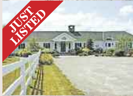
Lake Placid $3,000,000 "6.3 Acres of meadows and mountains"