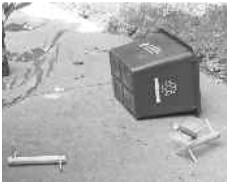
These wooden toys in the Greene Ave. area were left behind after August 20’s recycling pickup. The city does not accept wood for recycling.