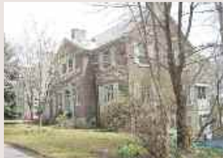
Westmount 4302 Montrose $3,155,000 "Georgian treasure"