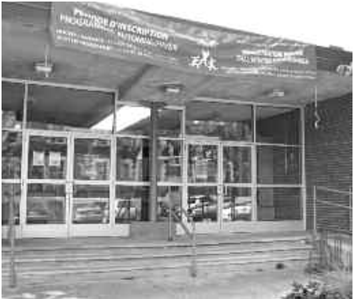
Arena project continues to draw comments and interest.