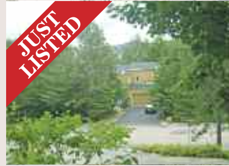
Mont Tremblant 110 Ch Desmarais $1,995,000 "Residential – commercial"