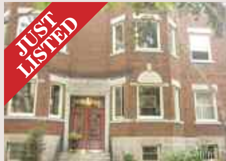
Westmount 388 Olivier #7 $379,000 "2 bedrooms, 1241 sq. ft."