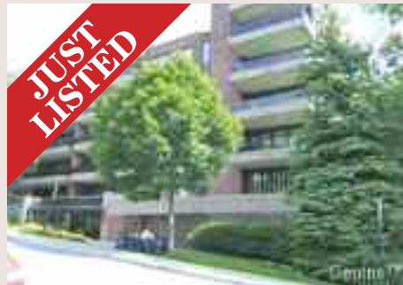
Downtown 3495 du Musée #101 $1,195,000 "3 bedrooms, 2896 sq. ft."