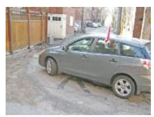
All traffic to the Batshaw lot (left) must turn this narrow, blind corner (right).

Some residents of Clandeboye have had enough traffic – in their backyards, that is.