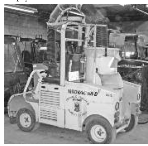
One of Westmount's current Madvacs.