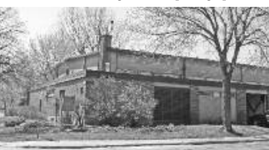
The rink today.

The updated feasibility study, just released, makes it clear that two hockey surfaces, on the site of the present arena, has been the basic demand of the city all along. However, the consulting architect warns that exactly the kind of critical issues raised by citizens on April 12 will make the building of an imposing sport-