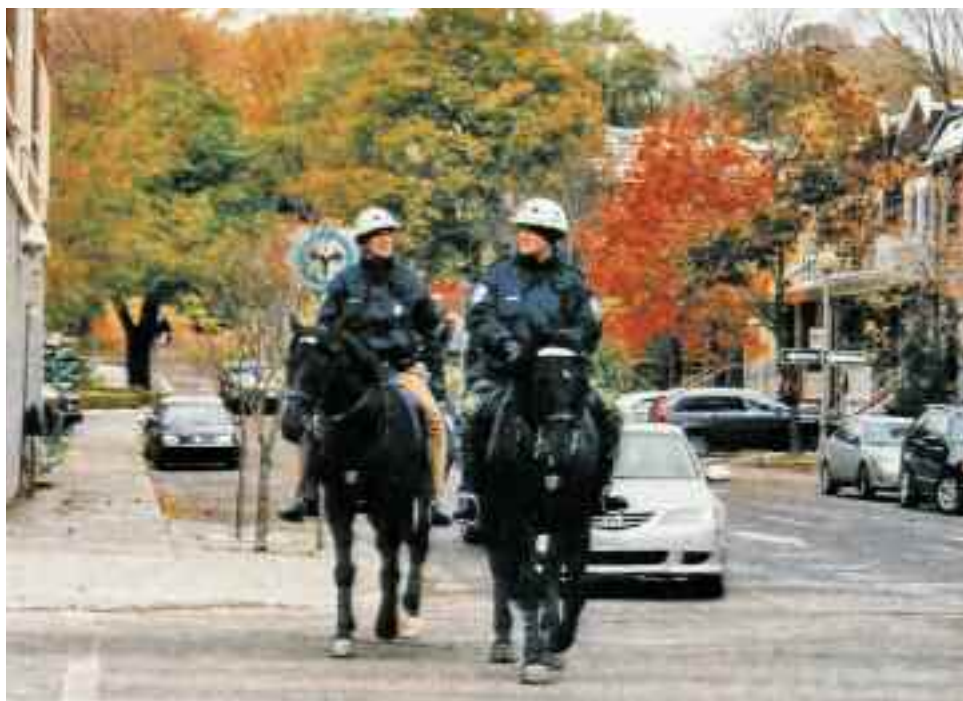
Shoppers at Victoria and Sherbrooke did a double take October 29 when these two police horses and riders from the cavalry section on Mount Royal were spotted coming down the hill outside the SAQ store.