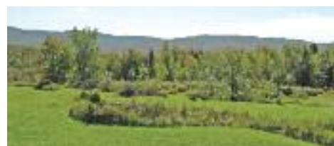
East Hill (Sutton) looking south towards the Sutton Mountain Range, September 30. The autumn leaves are at least a week away from peak colour.

At the end of the day, they'll get a bottle of their own wine, replete with a group photo on the label.