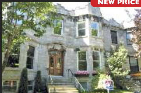
Westmount – 322 Elm Ave. Stunning renovations! Victorian elegance-Modern convenience. $1,535,000