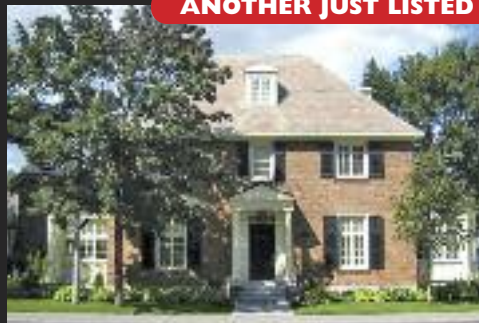
Westmount – 4287 Sherbrooke St. W The jewel of Sherbrooke St. Extraordinarily beautiful! $1,895,000