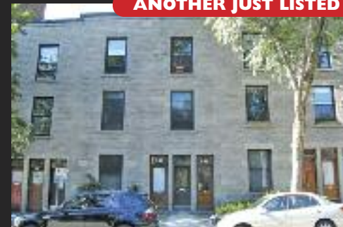
Westmount – 432 Claremont Ave. Spacious 2 bdr.+ den condo. Beautifully renovated! $449,000