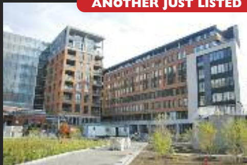
Old Montreal – 90 des Souers Grises #207 Quai de la Commune 5. Stunning 1 bdr. Private balcony. $298,000