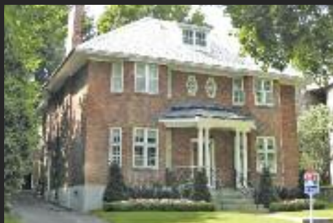
Westmount – 4355 Westmount Ave. Totally renovated and extended! Amazing location. $2,250,000