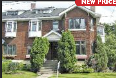
Westmount adj. – 5226 Cote St. Antoine Attractively priced + loaded with features! $665,000