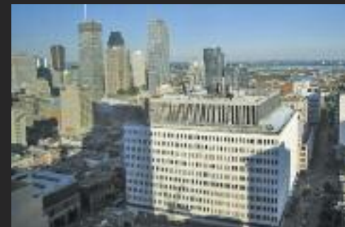
Downtown – The Port Royal – #2207 Exquisitely renovated. Spectacular views! $710,000