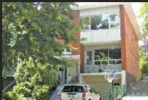
Outremont – 574 av. Davaar Absolutely best deal around. Great location. $679,000