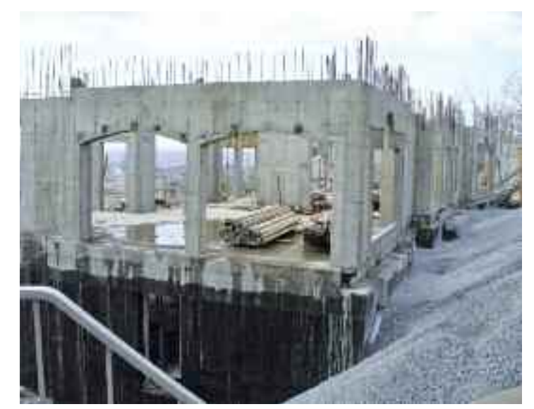
This imposing home being built by Paul Nassar directly east of the lookout can be seen from Sherbrooke St. Following the curvature of the road, it occupies the former site of 22 Summit Circle and an adjacent property.

These are reflected in requests to recover space in attics and under sloping roofs, to build roof-top decks, and even excavate deeper to create sub-basements and multi-car garages.