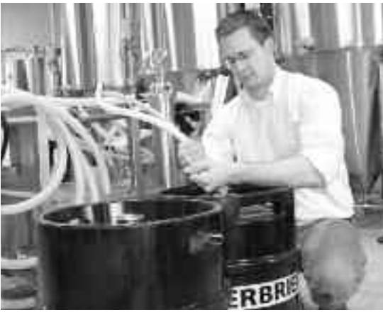
Filling a keg in the brew house of Bierbrier Brewing Inc., 310 Guy St.

After the yeast is filtered out, carbon dioxide is added and the beer is bottled or kegged.