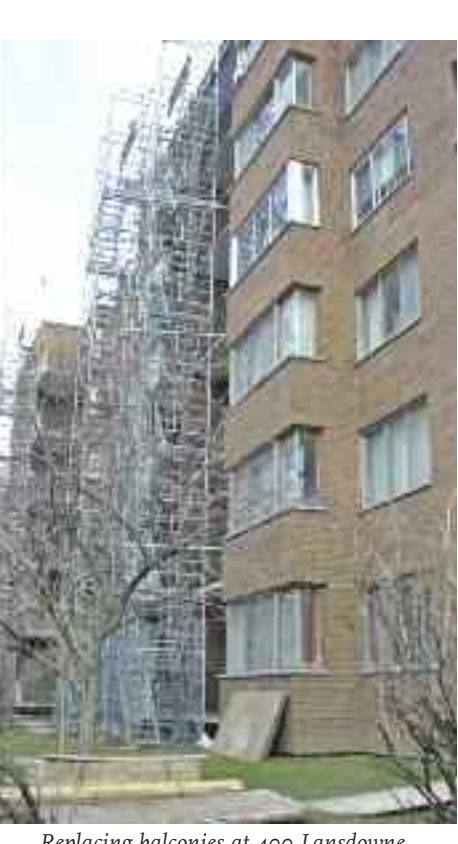
Replacing balconies at 400 Lansdowne.