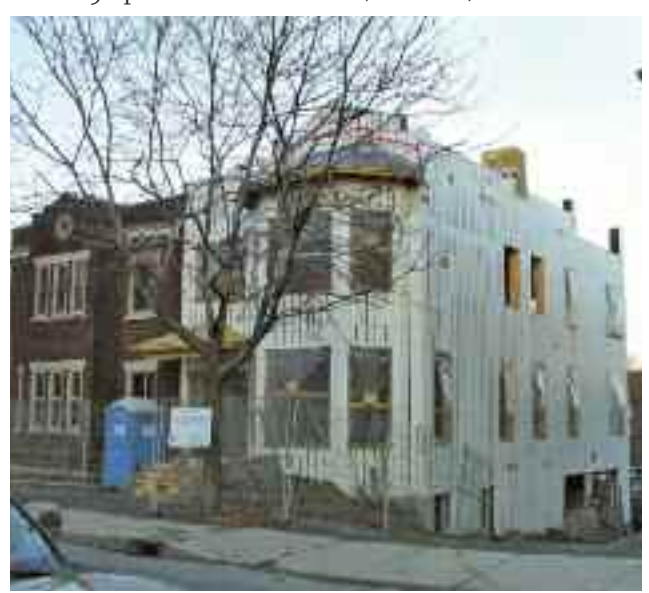
Work continues on this new semi-detached house immediately east of 536 Côte St. Antoine.