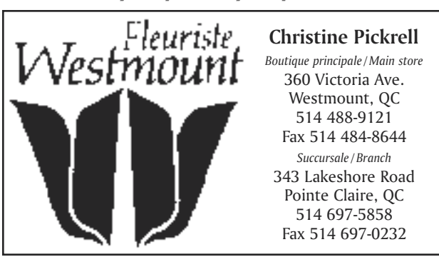
...support these community businesses...